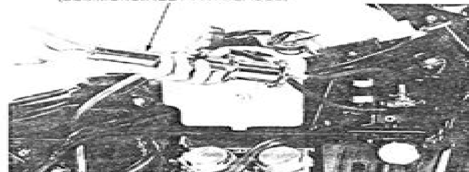
COOLING SYSTEM TESTER (COMMERCIALLY AVAILABLE)

Repair or replace components if the system will not hold the specified pressure for at least six seconds.