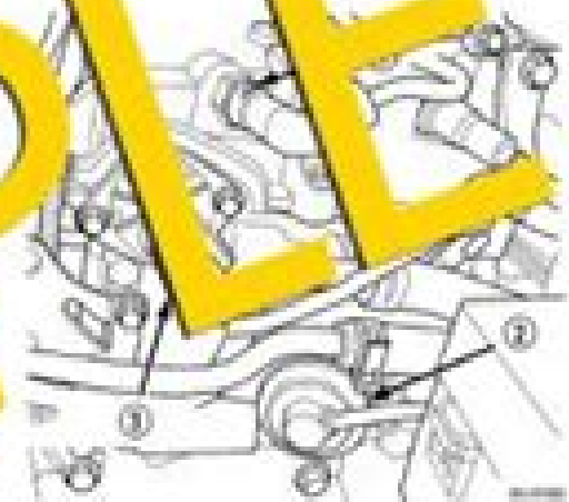
Fig. 1. Cambridge Position System (CPS) of the DORSAL

The PCM sends approximately 5 volts to the Hall effect sensor. This voltage is required to operate the Hall-effect chip and the electronics inside the sensor.