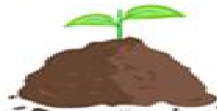
PILE OF DIRT