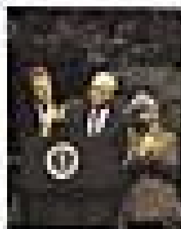
President Obama and Vice President Biden

What are the powers of the executive branch? The president has the power to sign laws, veto laws, and appoint and remove federal judges. The president also has the power to declare war and make treaties. The legislative branch has the power to make laws, approve or reject the president's appointments, and impeach the president. The judicial branch has the power to interpret the laws and declare laws unconstitutional.