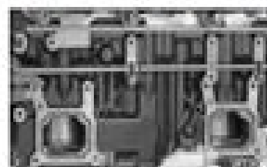
Figure 493 Oil cooler points