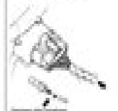
Connector pin stripped or damaged