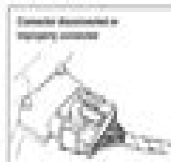
Connector disconnected or improperly connected