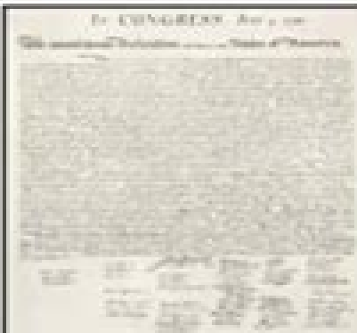
The Declaration of Independence

Coercive (Intolerable) Acts (1774): After the Boston Tea Party, the British passed a series of laws to punish the people of Massachusetts. The Boston Port was closed, and town meetings were banned.