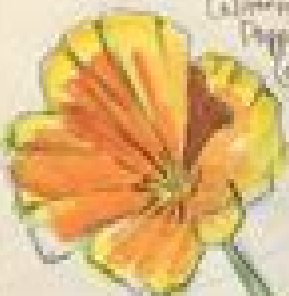
California Poppo (1915)

Let me draw the delicious quality of this land.