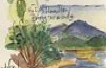
Peas and blossoms