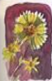
Perfectly dry type

I love how the color spots up when the flowers spot. Love looking back at