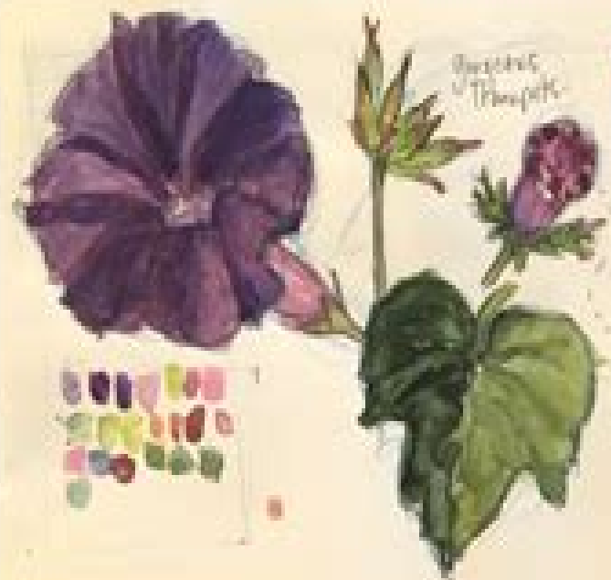
Quinine & Thapsia