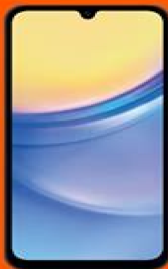
SAMSUNG Galaxy A51 5G