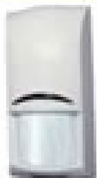
wLSN Dual Motion Detector Installation Instructions

ISW-BOL1-W11GX ISW-BOL1-W11GY ISW-BOL1-W11HX ISW-BOL1-W11HY ISW-BOL1-W11KX ISW-BOL1-W11KY