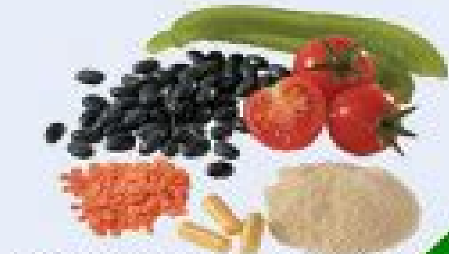
Herbs and dietary supplements