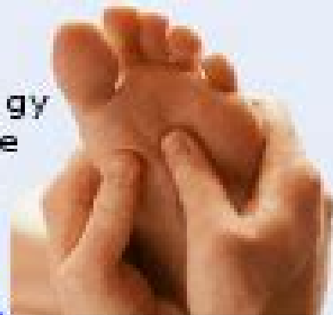
Chakra, Reiki, qi gong