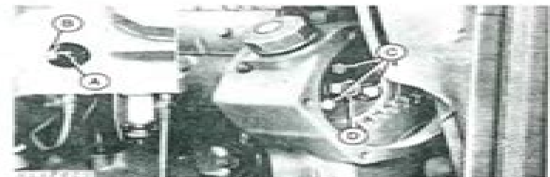
A—Drive Hub Mark B—Pointer Mark

5. If timing is correct, replace plugs and reconnect hose.