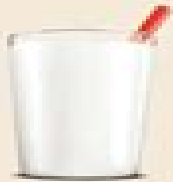
Fat Free Milk