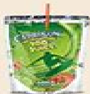
Capri Sun Apple Juice