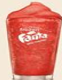
Frozen Fanta® Wild Cherry