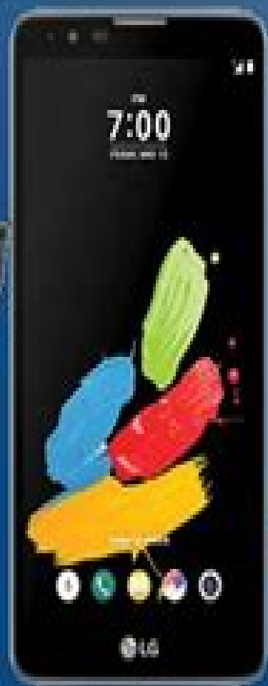
LG STYLO 2