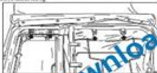
2007 Left side of front seat backrest (Truck model). Remove the front seat backrest.