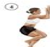
Garudhasana (Eagle Pose)