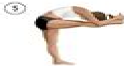
Dandayamana Janushirasana (Standing Head To Knee Pose)