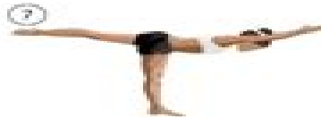
Tuladandasana (Balancing Stick Pose)