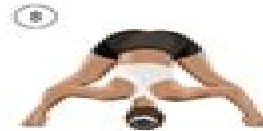
Dandayamana Bibhaktapada Paschimotthanasana (Standing Separate Leg Stretching Pose)