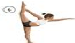
Dandayamana Dhanurasana (Standing Bow Pulling Pose)