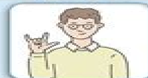
I Love You