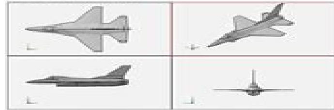
Fig. 2. Four-view of the VSPAero 3D model for the F-16

analyzed using VSPAero tool, a potential flow solver developed by NASA Ames. A low-fidelity 3D model was made according to the best knowledge acquired, and the results of the software analysis were compared with those obtained from analytical calculations to validate the accuracy of the results and provide a more comprehensive understanding of the aircraft's behavior in straight and level flight. The four view and one isometric view of the 3D model is shown below: