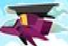
SUPER SONIC JET