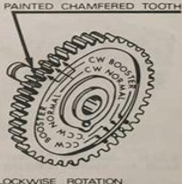
Figure 2-32. Modified Six Cylinder Gears