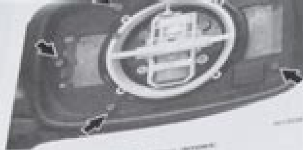
Fig. 2. Mirror housing mounting screws (arrows)