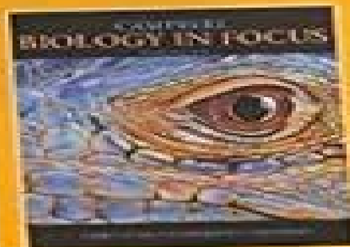
AP ® Edition, 3rd Edition