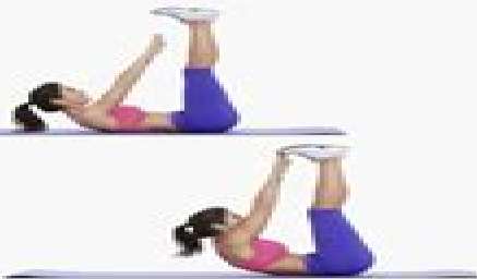
10 TOE TOUCHES