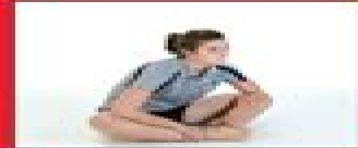
Shoulder Stretch: Pull one arm across your chest and hold for 15-30 seconds.