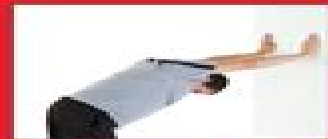
Back and Hamstring Stretch: Lean forward with arms extended and hold for 15-30 seconds.