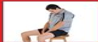
Hamstring Stretch: Sit on a chair, lean forward, and hold for 15-30 seconds.