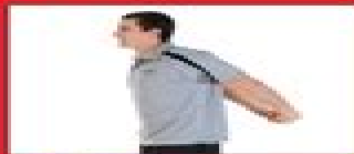
Shoulder Stretch: Pull one arm behind your back and hold for 15-30 seconds.