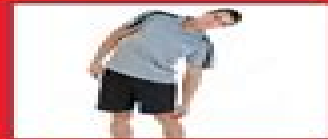
Hamstring Stretch: Lean forward and hold for 15-30 seconds.