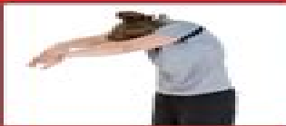
Hamstring Stretch: Lean forward and hold for 15-30 seconds.