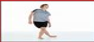
Hamstring Stretch: Lean forward and hold for 15-30 seconds.