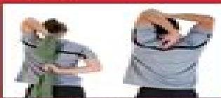
Shoulder Stretch: Pull one arm across your chest and hold for 15-30 seconds.