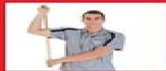
Shoulder Stretch: Pull one arm behind your back and hold for 15-30 seconds.