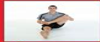
Shoulder Stretch: Pull one arm across your chest and hold for 15-30 seconds.