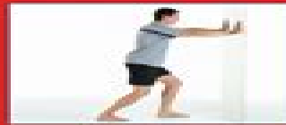
Hamstring Stretch: Lean forward and hold for 15-30 seconds.