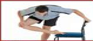
Hamstring Stretch: Lean forward and hold for 15-30 seconds.