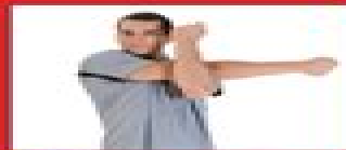
Shoulder Stretch: Pull one arm across your chest and hold for 15-30 seconds.