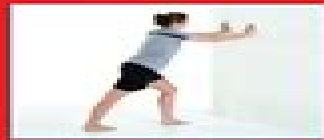
Hamstring Stretch: Lean forward and hold for 15-30 seconds.