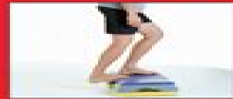
Hamstring Stretch: Lean forward and hold for 15-30 seconds.