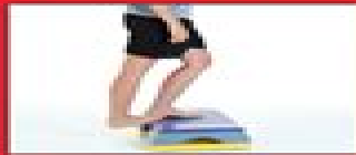
Hamstring Stretch: Lean forward and hold for 15-30 seconds.