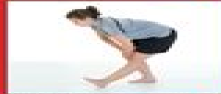
Hamstring Stretch: Lean forward and hold for 15-30 seconds.