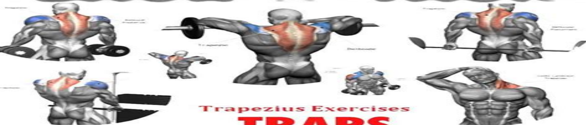
The shrug (4 sets)