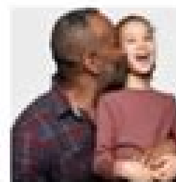
Gifts for everyone