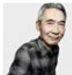
Gifts for grandparents