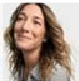
Gifts for your significant other