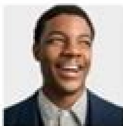
Gifts for friends