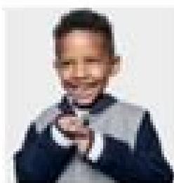
Gifts for kids