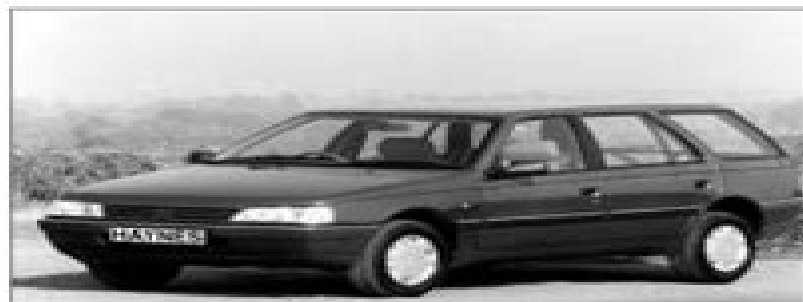
Peugeot 405 GL Estate