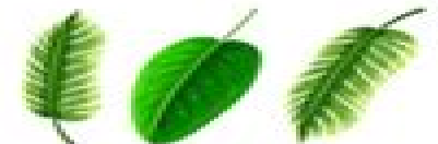
THREE TYPES OF LEAVES