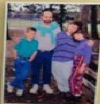
The Bravo Family makes learning ASL fun!