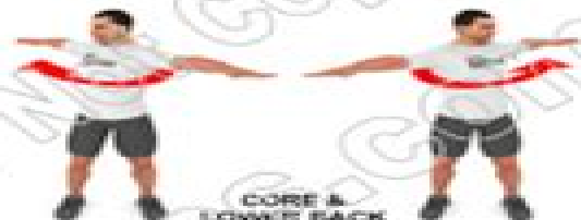
CORE & LOWER BACK