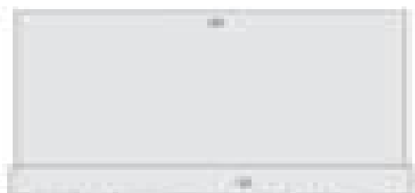
Figure 1-3: Accenta/Optima software interface showing a signal waveform.