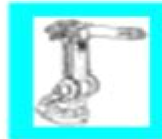
ABB Flexible Automation