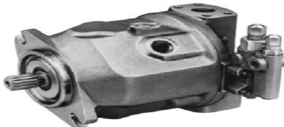
A 1 0 V 0 P U M P