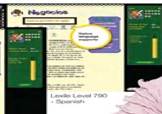
Lexile Level 790 - Spanish