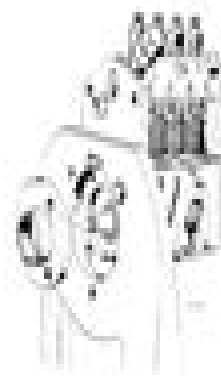
Figure 16. Rotating fuel fuel camshaft

surface of the camshaft must be smooth and free from all marks, scratches, rust, or corrosion. If the cam shaft and slightly pitted, their surface may be polished with