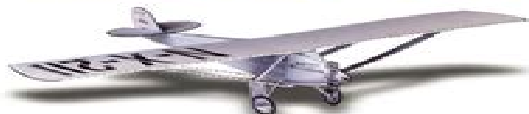
Spirit of St. Louis