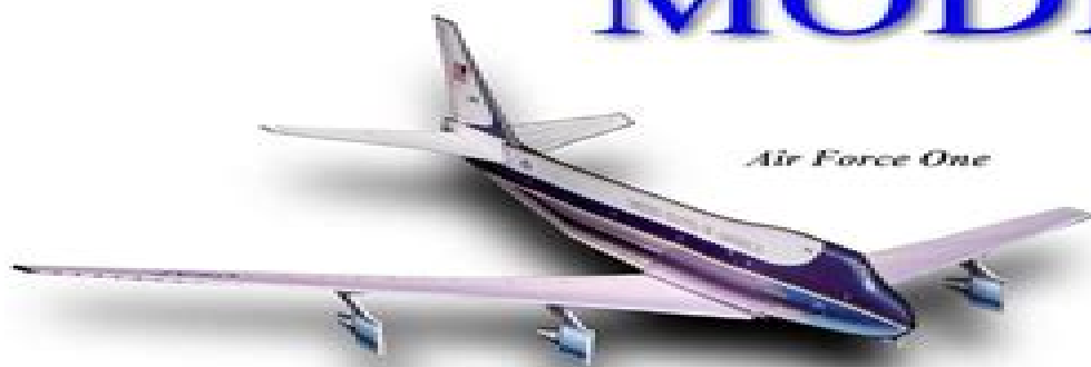
Air Force One