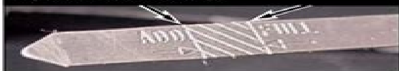
Figure 3 — Dipstick Markings