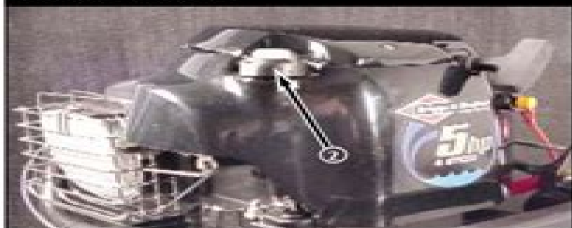
Figure 2 — Dipstick