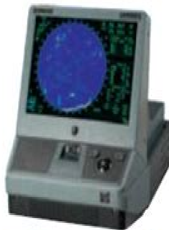
BridgeMaster E 180