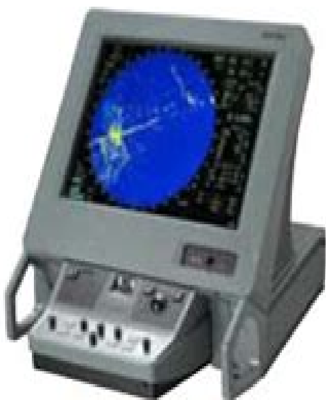
BridgeMaster E 340 Desktop