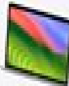
MacBook Air with Retina display

Education pricing shown for all Mac models.