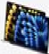
MacBook Pro with Retina display