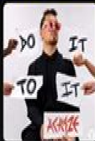
STATION Do It To It (feat. Cherish)