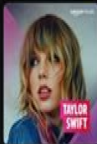
STATION Taylor Swift