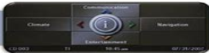
Car Communication Computer CCC - 2003