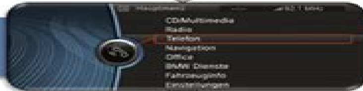
Car Information Computer CIC - 2008