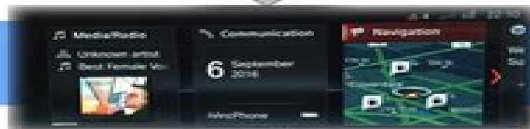
Next Big Thing EVO EVO ID6-2017