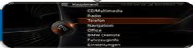
Next Big Thing NBT - 2012