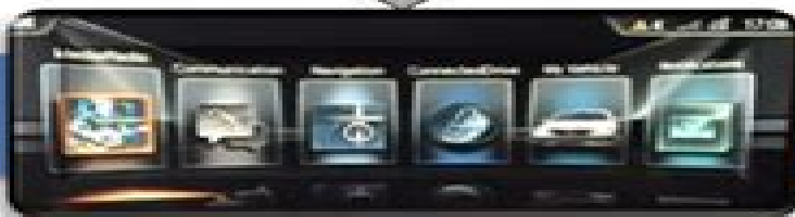
Next Big Thing EVO EVO-ID5-2015