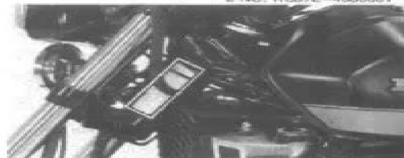
The vehicle identification number (VIN) is on the steering head left side.