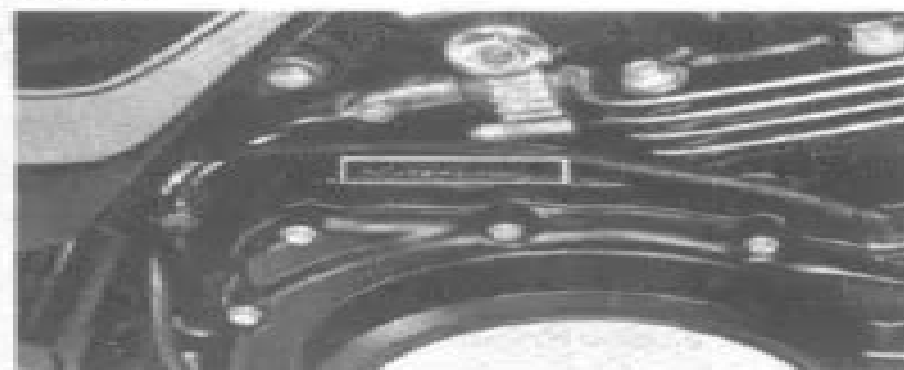
The engine serial number is stamped on top of the right crankcase.