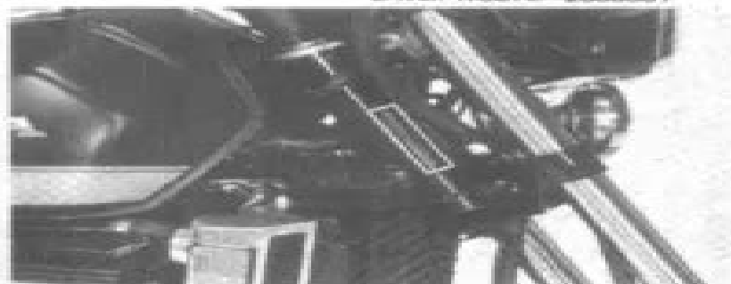
The frame serial number is stamped on the steering head right side.