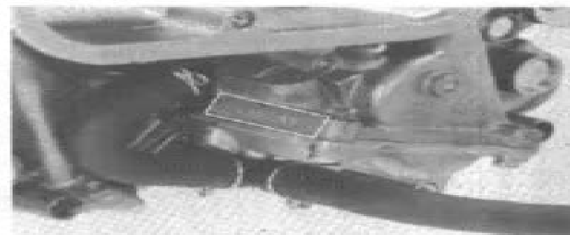
The carburetor identification number is on the carburetor body left side.