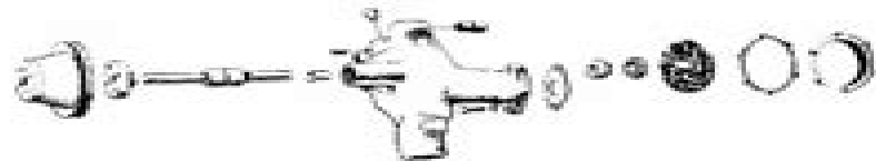
352", 390", 410", 427", 428", 430", 462" ENGINES WATER PUMP