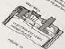
Figure 12 Storage Battery

When the battery is not in use, it should be stored in a cool, dry place. The battery should be stored in its original container, and the container should be sealed. The battery should be stored in a position that will prevent leakage of electrolyte. The battery should be stored in a position that will prevent damage to the terminals. The battery should be stored in a position that will prevent damage to the case. The battery should be stored in a position that will prevent damage to the internal components. The battery should be stored in a position that will prevent damage to the external components. The battery should be stored in a position that will prevent damage to the overall unit.