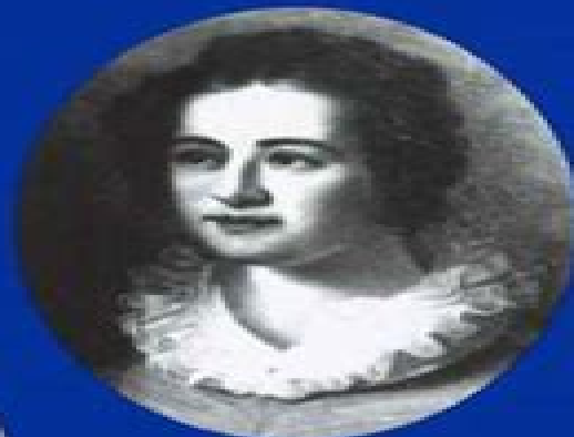
Ann Judson 1789-1826