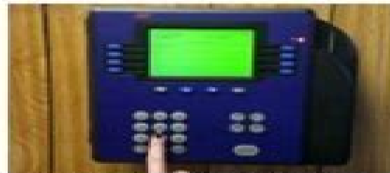
Step 4: Leave this field blank