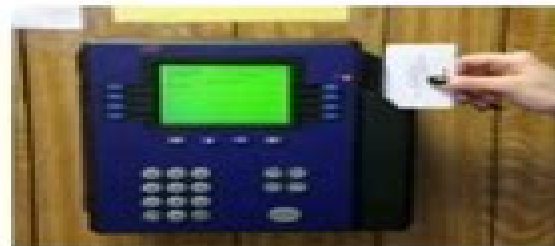
Step 6: Swipe your card (A successful read will generate a beep and a green light)