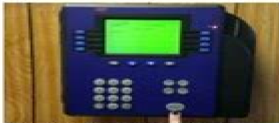
Step 3: Press the Enter button (the time clock will prompt for your 3-digit job code)