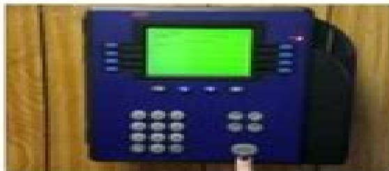
Step 5: Press the Enter button (the time clock will prompt for your employee ID)