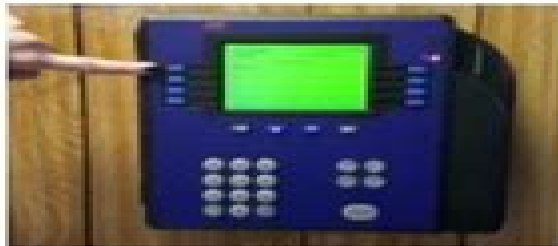
Step 1: Press the Transfer button on the left side of the time clock

As you are eligible to work in any of the QACPS schools, you will need to provide the location of your work. Since you do not perform any hourly work, it is not required for you to enter your job code.