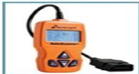
Actron AutoScanner CP9575