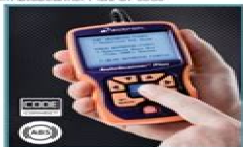
Actron AutoScanner Plus CP9580