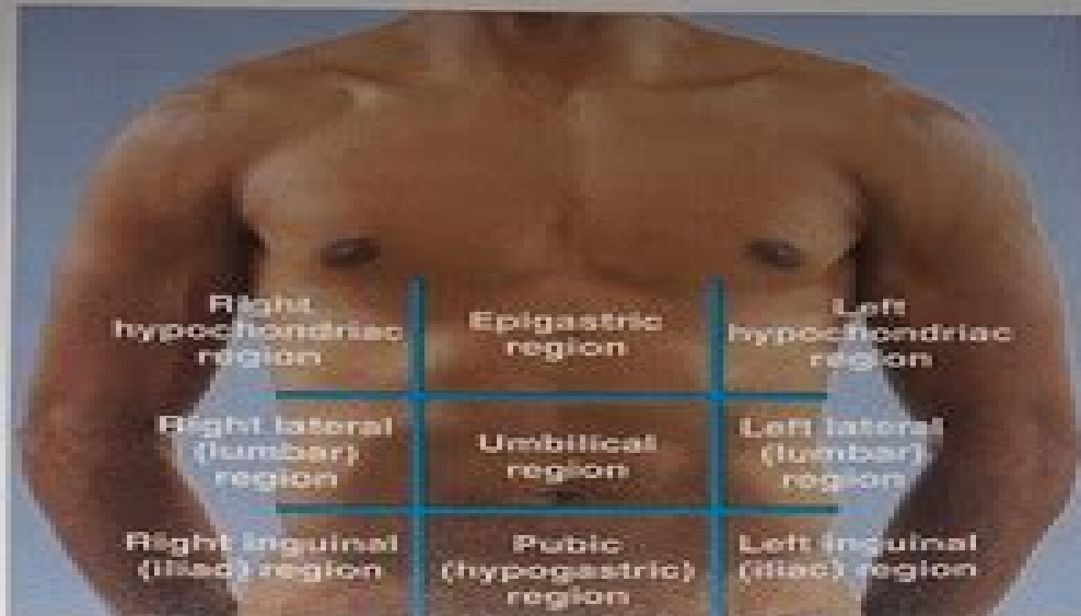
(a) Nine regions delineated by four planes