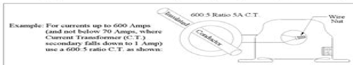
Figure 3: Current Transformer

⚡ Remember that the secondary of the 5A CT must be shorted together before the power may be turned on from the device.