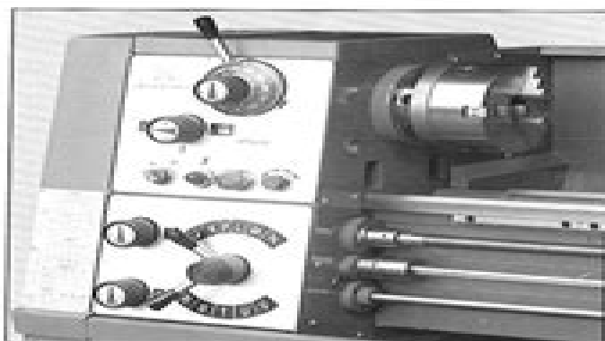
HEAD STOCK & GEARBOX